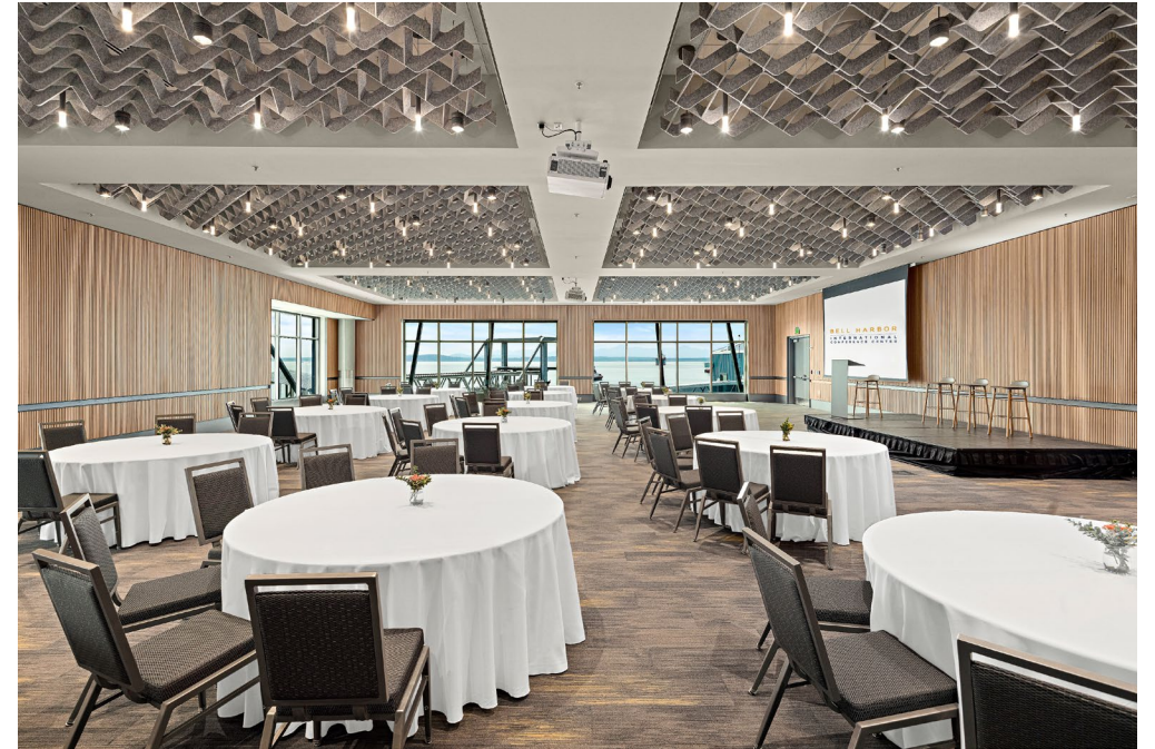
After – Energy Efficient Lighting with Full Range of Lighting Controls, New A/V Systems, and Furnishings