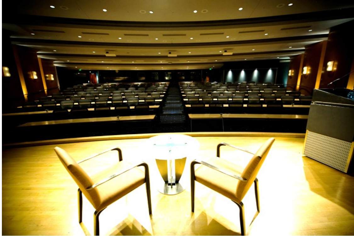
Before – Limited Lighting Control Options, Dated Audio Visual Equipment and Furnishings