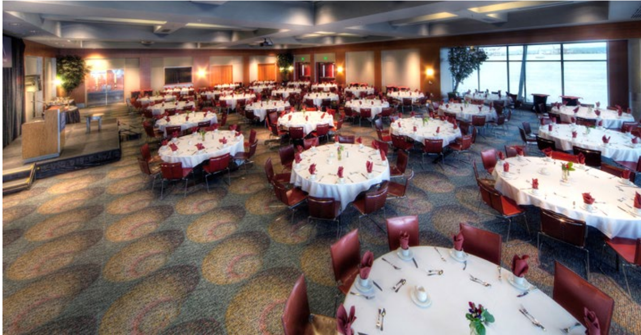
Before – Limited Lighting Control Options, Dated Audio Visual Equipment and Furnishings