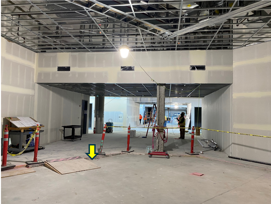
Undocumented Flooring Thicknesses