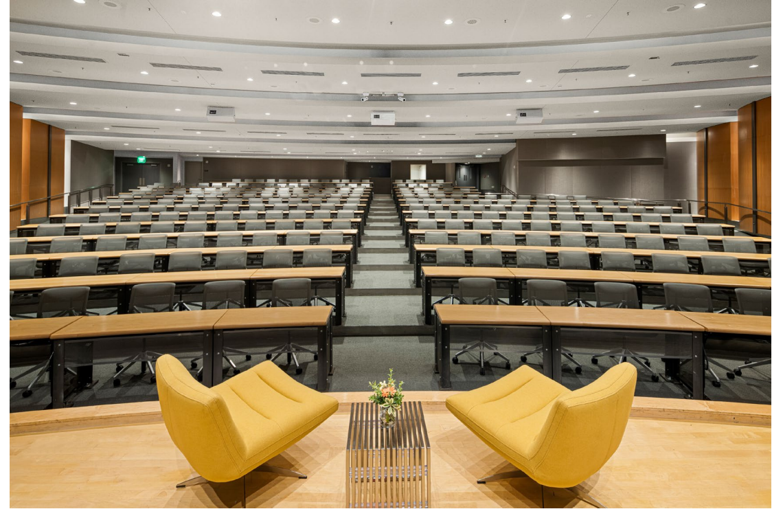
After – New Energy Efficient Lighting With Full Range and Programmable Lighting Controls, New A/V Systems, and Additional Tables and Seating