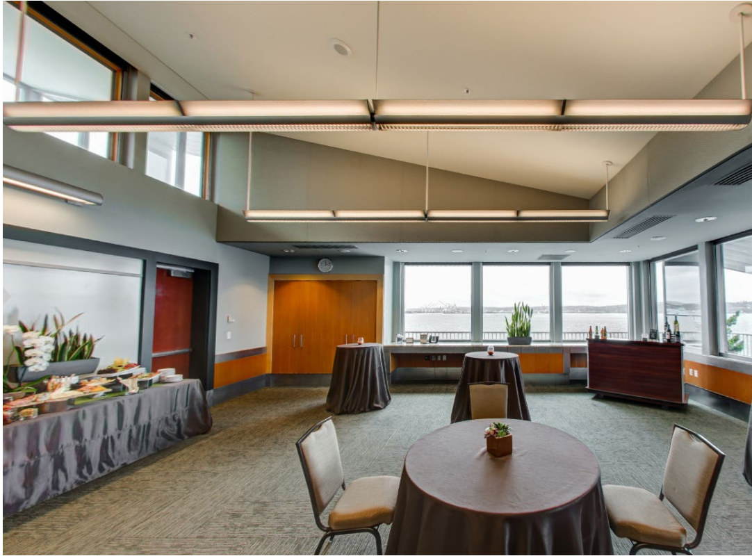
Before – Limited Lighting Control Options, Dated Audio Visual Equipment and Furnishings