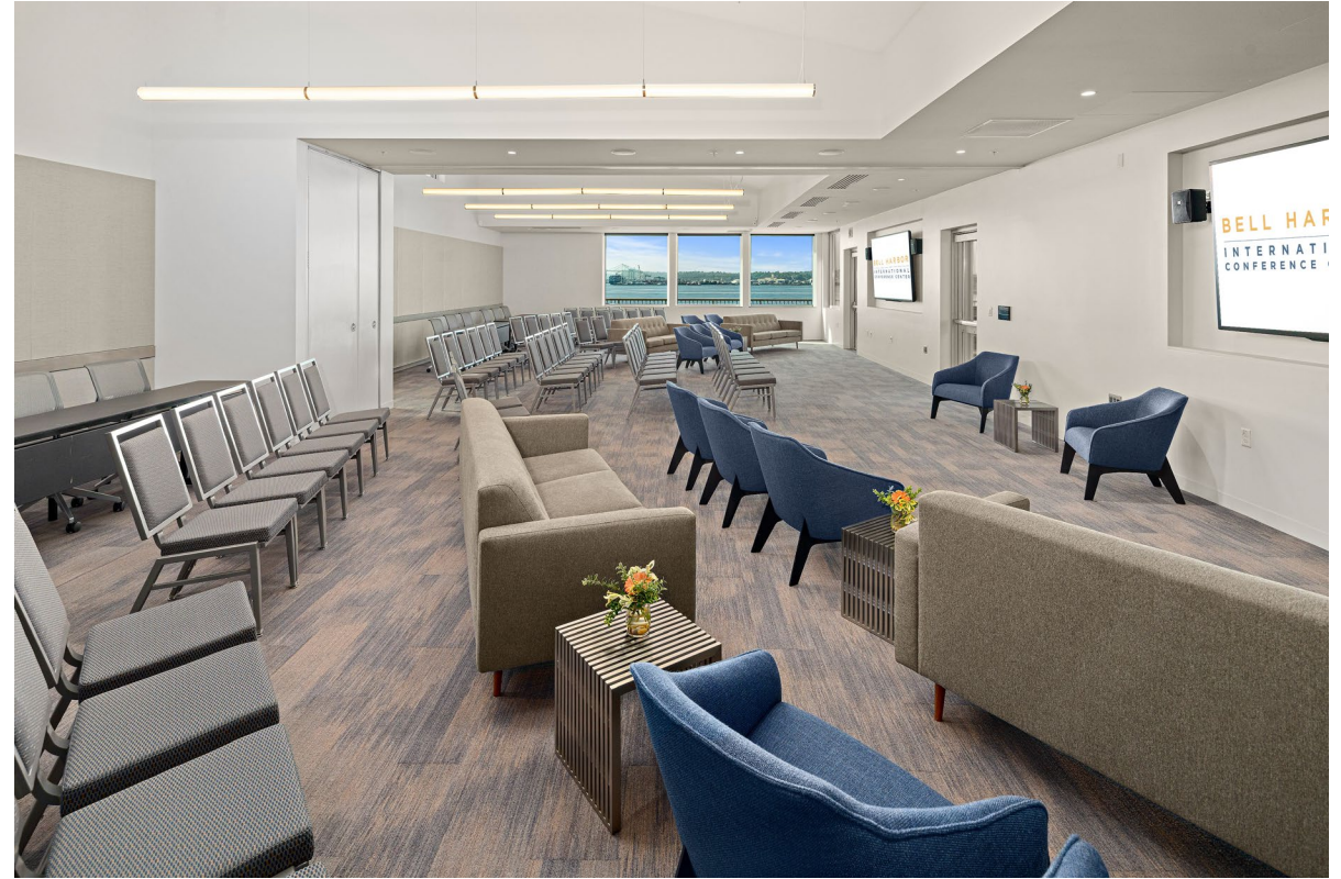
After – Flexible Meeting Space with Operable Partition, Energy Efficient LED Lighting with Full Range of Lighting Controls, New A/V System and Furnishings